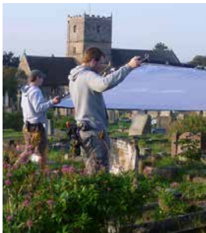
St Andrew's Church